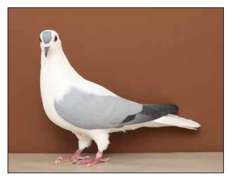
NPA National, Best CL Wing Pigeon Blue Barless OH #658 Dave Hollaway