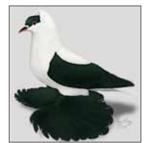
"Standard Revision Update"