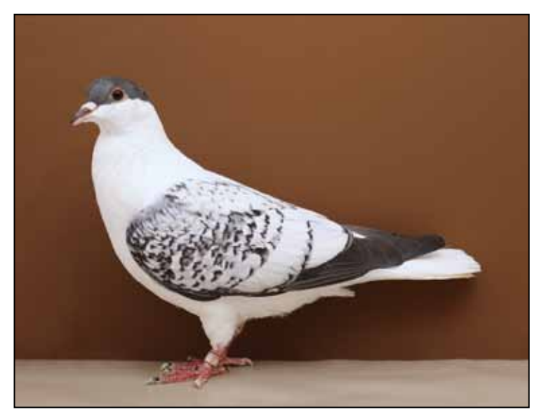
NPA National, Best CL Swallow OC #750 Dave Hollaway