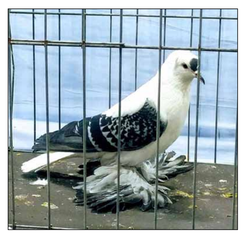
YH #1196 Blue Check Fairy Swallow was the Reserve Champion Swallow rated HS-96... owned by: Steve Dreitz of Pueblo, Colorado